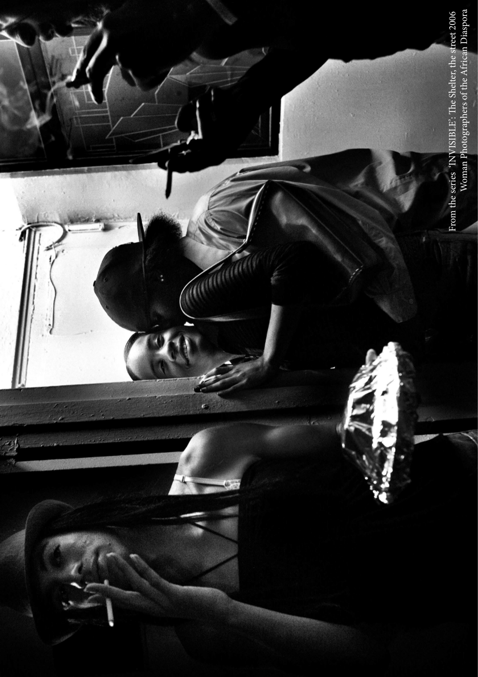
From the series 'INVISIBLE': The Shelter, the street 2006 Woman Photographers of the African Diaspora