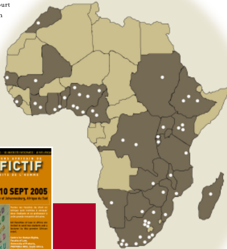
Map showing the countries and Universities represented at the African Human Rights Moot Court Competition 2005.