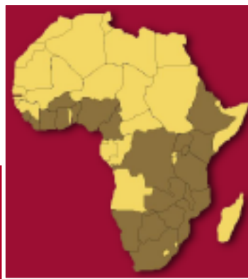
Law of Africa Collection: Legislation

Initiated by the Centre in collaboration with the Oliver Tambo Law Library, the Law of Africa Collection is the largest collection of primary legal texts (legislation and court decisions) of the 53 African countries available under one roof in the world today.