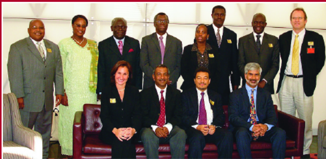
Judges in the final round of the 14th African Human Rights Moot Court Competition held at the Constitutional Court, South Africa

A total of five full-time students worked on their doctoral dissertations in the Centre during 2005. They attended regular meetings where progress was discussed. Another ten part-time doctoral students were registered in the Centre.