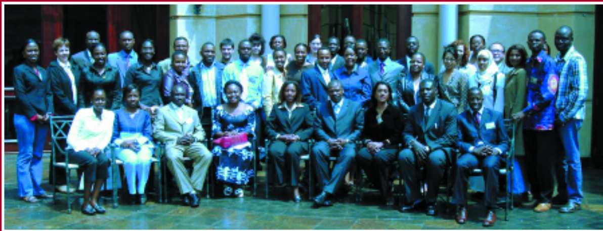
Lecturers and participants at the 2nd Trade Moot Simulation held in Pretoria