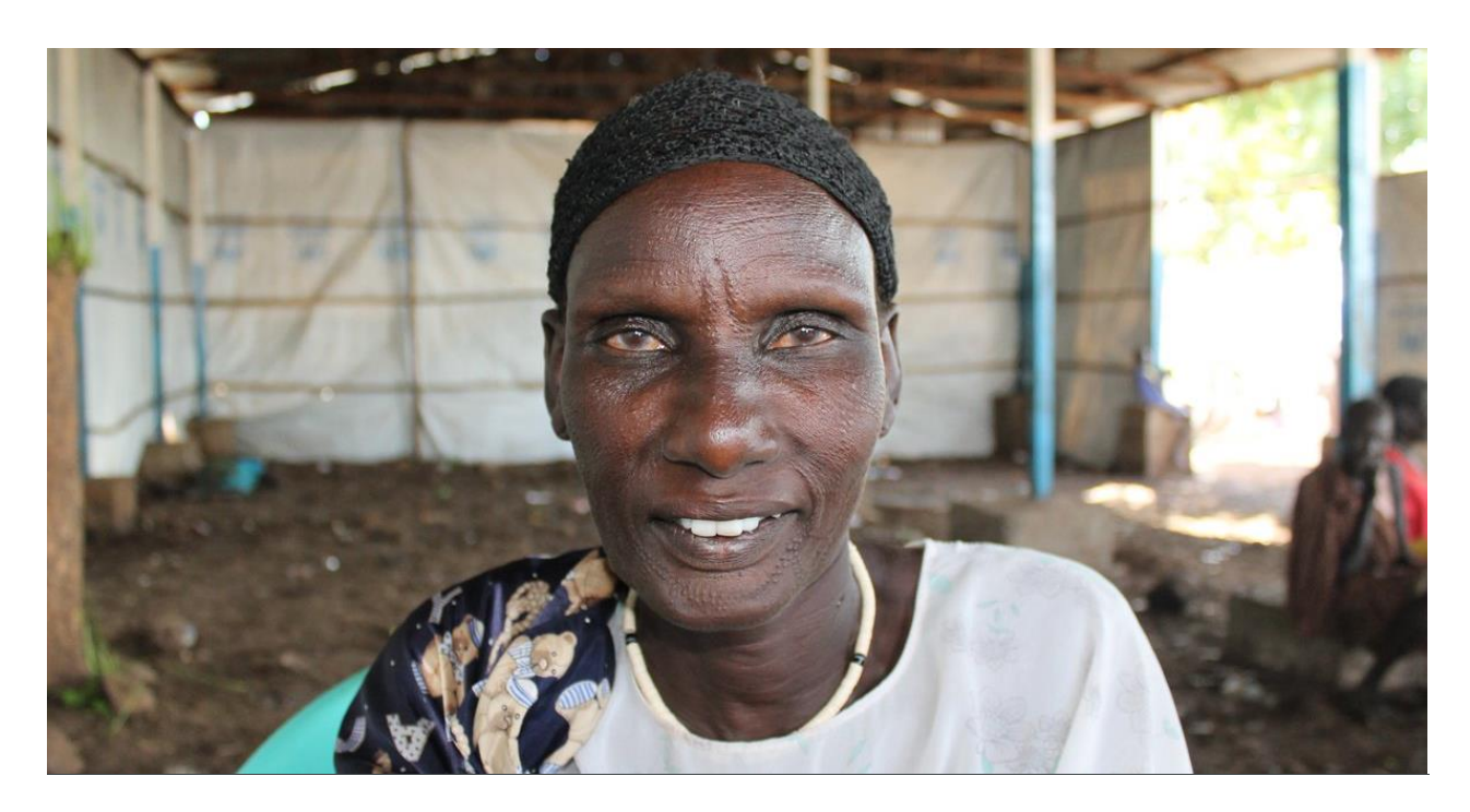
Africa Regional and National Humanitarian Plan