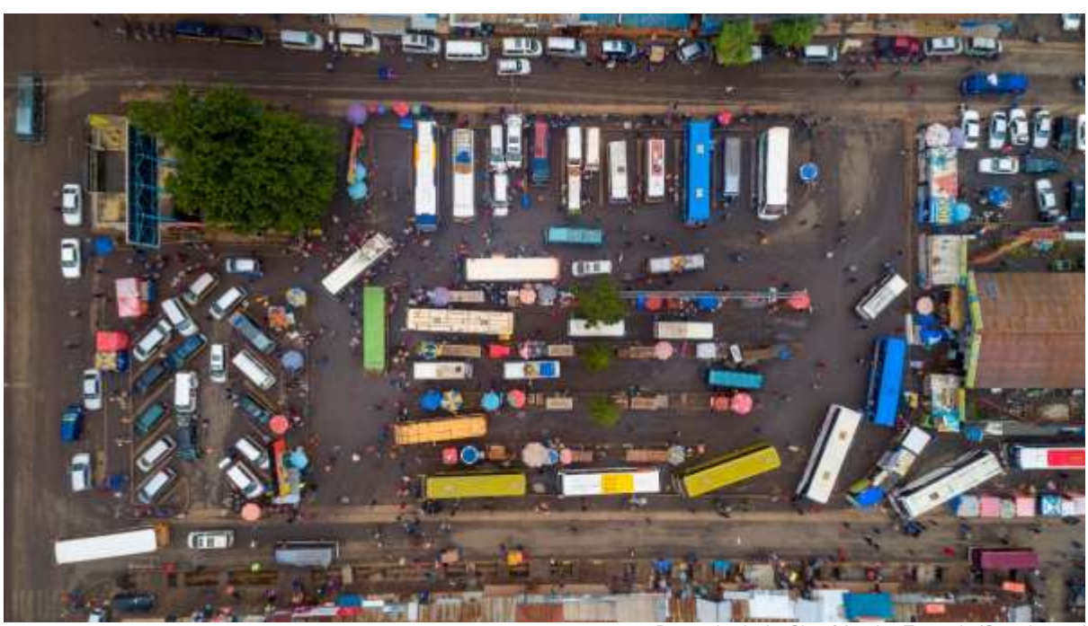
Bus station in the City of Arusha, Tanzania

With a focus on water (flooding and water resources) and enhancing information, communication and technology